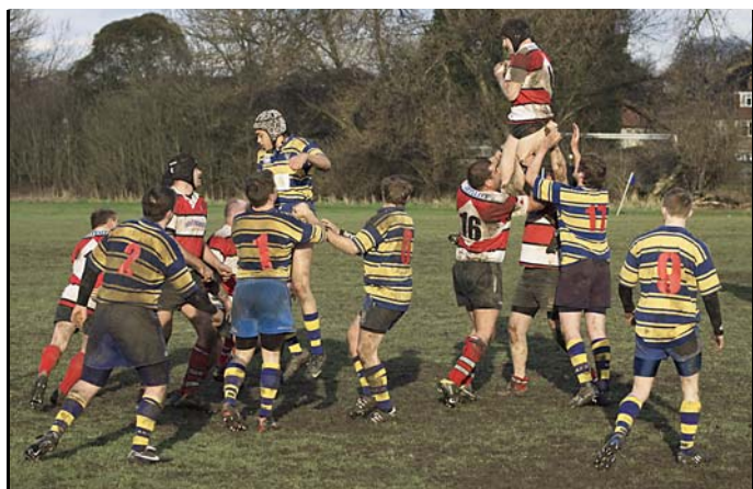
3rds vs Beckenham