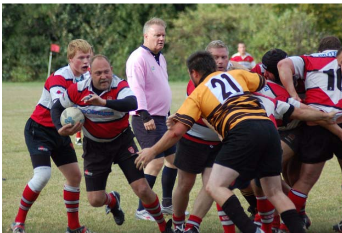
3rds vs Bromley