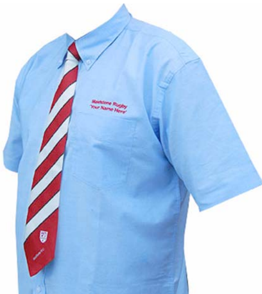
Maidstone FC No. 1 Shirt