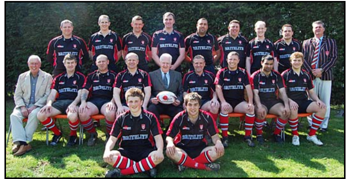
The Third XV with their sponsors - Britelite